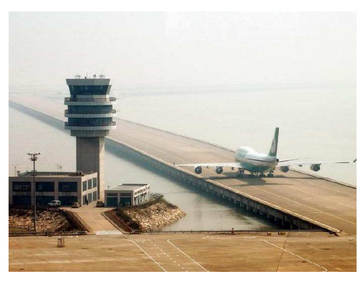
Macao International Airport