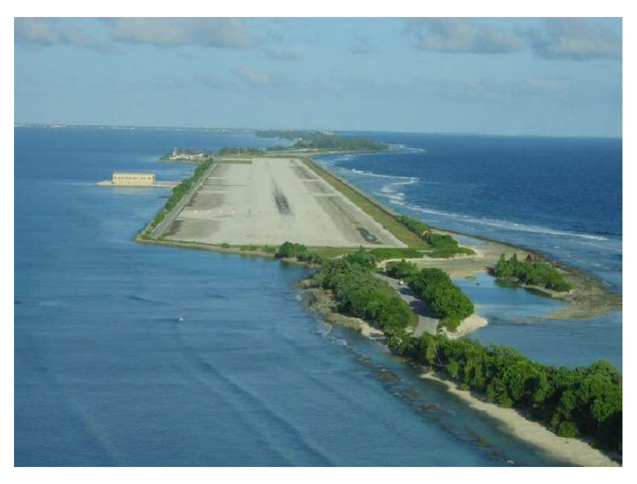
Wake Island, Pacific Ocean