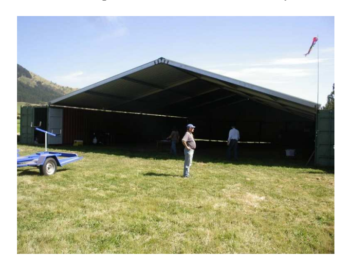
Kel Glare surveys the Flowerdale Airstrip

It was so pleasant cruising around the surrounding hills as I commenced descent I was tempted to go a bit further to see what else lay slightly beyond, but, looking below, cars were pulling into the paddock for the wing maintenance session and so after a low circuit to check the lay of the land I touched down on Gary's grass strip, with the aid of a generous serve of disc brakes to prevent a closer than necessary look at the shrubbery at the end of the strip.