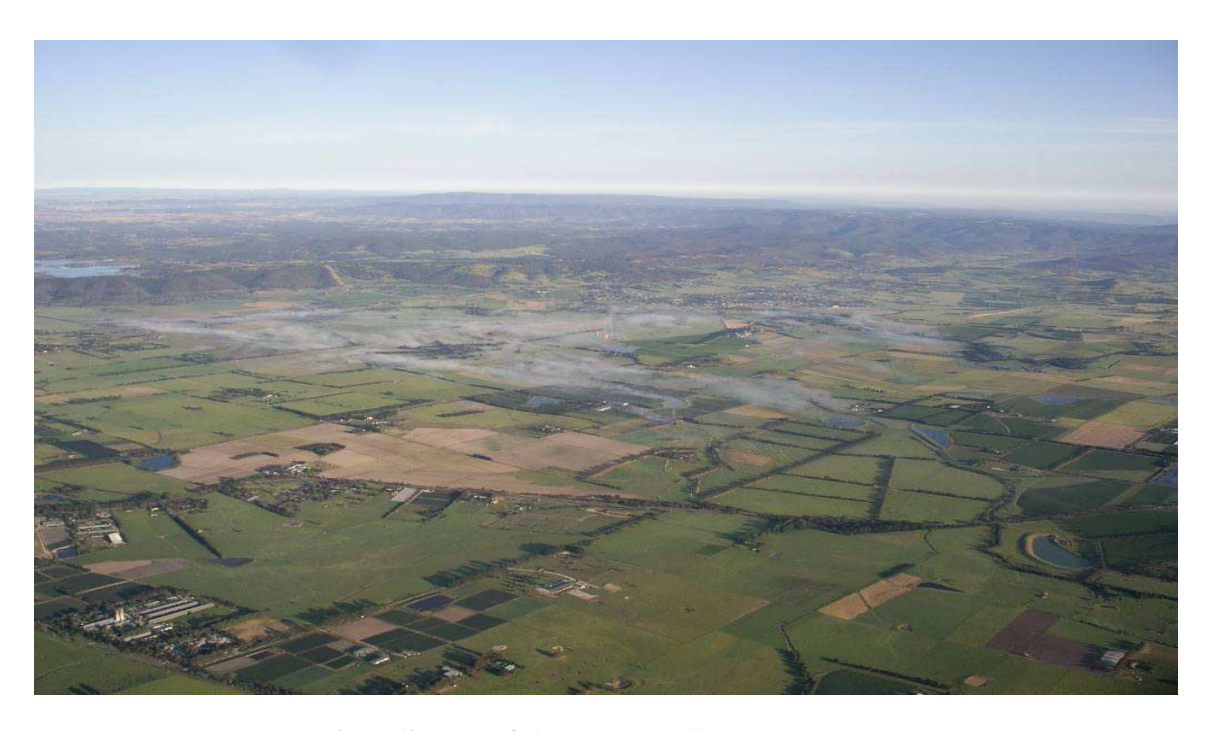
First glimpse of the Yarra Valley

The nil wind departure from the blue hazy skies of Latrobe Valley at 0600hrs was uneventful until I reached 500 ft at which time the ground speed morphed from 65 kts to 43. Unbelievable!! This would slow the trip down significantly, however, fuel was still not an issue, so I sat back prepared to enjoy slightly more airtime than expected. As was so often the