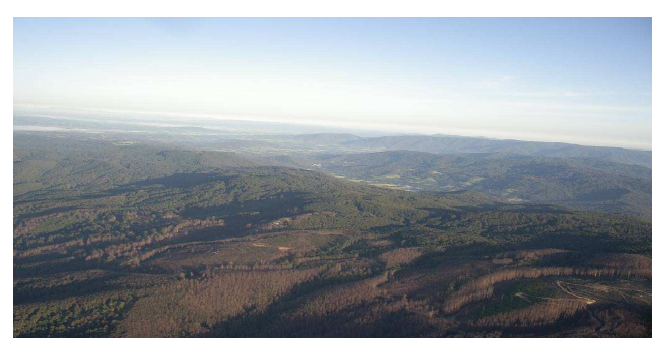
Bunyip Ridge still bears the scorch marks of Black Saturday.