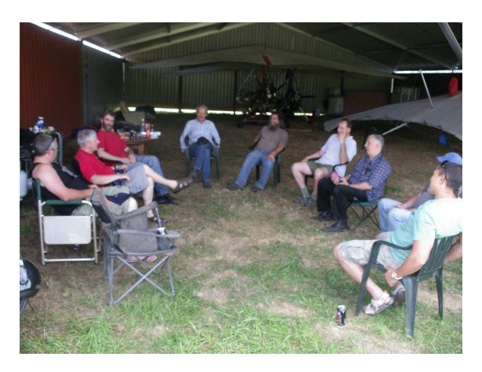
A relaxed lunch at the end of the session

in his Hang Glider from Landscape Launch some 15nm away in the hills overlooking Seymour.